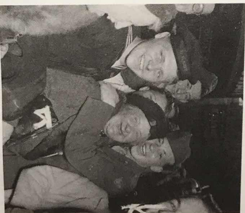
American fighting men hug a British woman at the end of World War II

Because the United States started as a series of English colonies, American culture has been hugely influenced by England. The culture of England (and Great Britain) affects everything from what we Americans eat to how we